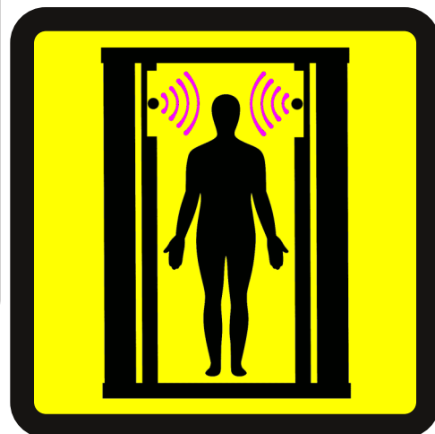
Millimetre waves from airport full-body scanners

Without your prior informed consent, they are breaking the law.