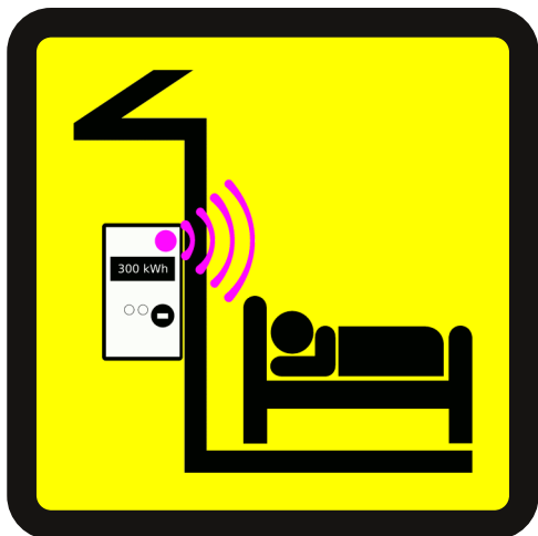
Modulated microwaves from SMART meters (that record your electricity usage in great detail)