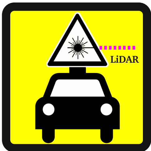
Potentially blinding laser beams from driverless cars